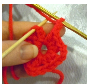
Into 3rd beginning chain