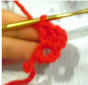
Double crochet twice into ring