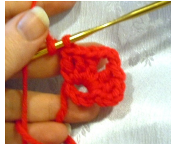
Chain 3 stitches, double crochet into ring three times