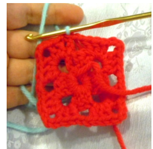
Change color, by slip stitching in new color