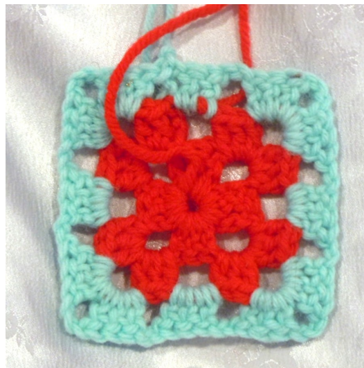
Back of finished square

Continue working new rounds in the same manner. Turn the square over after every round. Work a chain 3 and 2 double crochets into the first chain space, then chain 2 and work 3 double crochets in each chain space across to the corner chain space. Each corner chain space will have 3 double crochets, chain 3, 3 double crochets. When you wish to end the square. Join with the same color as the final round, work 1 chain, cut the yarn and pull the yarn end through the final chain loop. Weave in all of the ends, by threading them under the double crochet stitches.