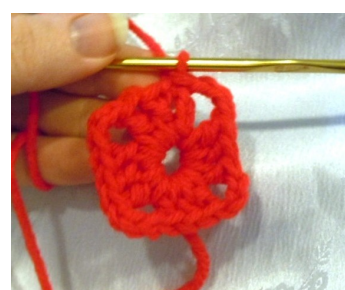
Slip Stitch to join

Step 3: 3a] Turn the square over and in the first corner chain space (ch sp); chain 3 stitches, double crochet twice, chain 3 stitches, double crochet 3 times. 3b] Chain 2 stitches and in the next chain space, double crochet 3 times, chain 2 stitches, then in the corner chain space, double crochet 3 times, chain 3, double crochet 3 times. 3c] Repeat [3b] two more times. 3d] Chain 2 stitches and join to beginning of the round by slip stitching (sl st) into the third chain of the beginning chain 3. {If you wish to change color use the new color to join.}