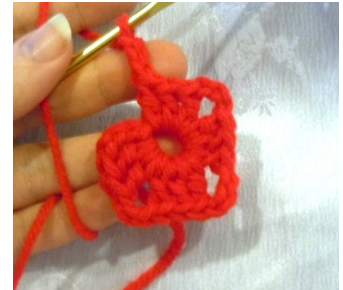
Repeat last step [2b] twice