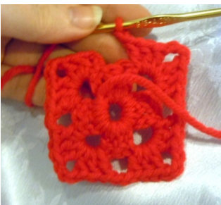
Front of square Round 3 finished

Step 3: 3a] Turn the square over and in the first corner chain space (ch sp); chain 3 stitches, double crochet twice, chain 3 stitches, double crochet 3 times. 3b] Chain 2 stitches and in the next chain space, double crochet 3 times, chain 2 stitches, then in the corner chain space, double crochet 3 times, chain 3, double crochet 3 times. 3c] Repeat [3b] two more times. 3d] Chain 2 stitches and join to beginning of the round by slip stitching (sl st) into the third chain of the beginning chain 3. {If you wish to change color use the new color to join.}