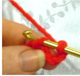
In first chain