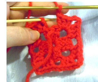
Into 3rd chain of beginning chain