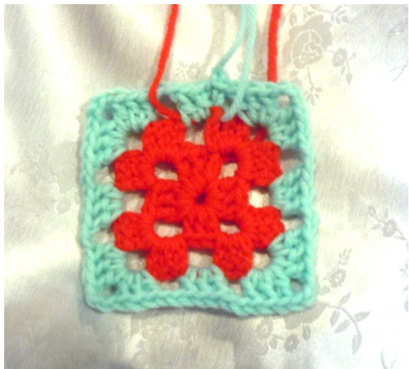
Front of finished square

Step 4: 4a] Turn the square over and in the first chain space, chain 3 stitches, double crochet twice. 4b] Chain 2 stitches, and in the corner chain space, double crochet 3 times, chain 3, double crochet 3 times. 4c] Chain 2 stitches and in the next chain space, double crochet 3 times, chain 2 stitches, then in the corner chain space, double crochet 3 times, chain 3, double crochet 3 times. 4d] Repeat [4c] two more times. 4e] Chain 2 stitches and join to beginning of the round by slip stitching (sl st) into the third chain of the beginning chain 3.