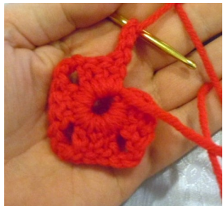
Back of Square