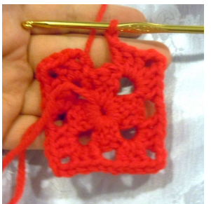
Cinched center closed