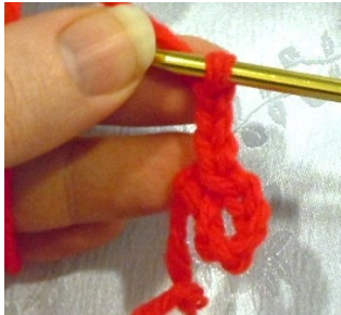
Chain 3 stitches

Step 2: 2a] Chain (ch) 3 stitches, double crochet (dc) twice into the ring. 2b] Then chain (ch) 3 stitches and double crochet (dc) twice into the ring. 2c] Repeat the last step [2b] two more times and chain (ch) 3 stitches. 2e] Join to beginning of the round by slip stitching (sl st) into the third chain of the beginning chain 3.